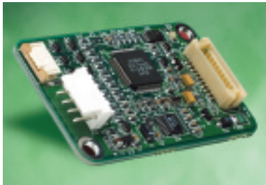
2216 combo controller board